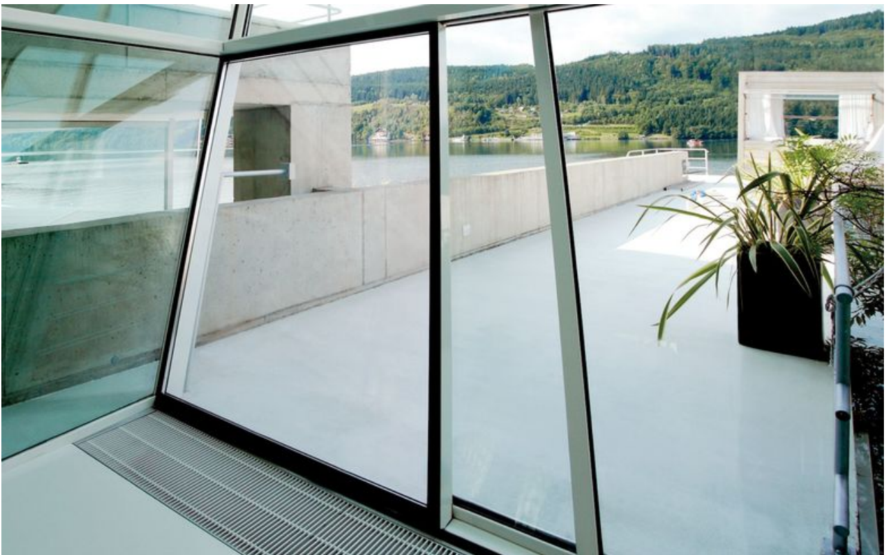
Automatic linear sliding door system for use on inclined glass façades